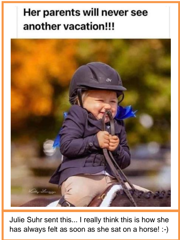
Her parents will never see another vacation!!!

If you eat an entire cake without cutting it, you technically only had one piece