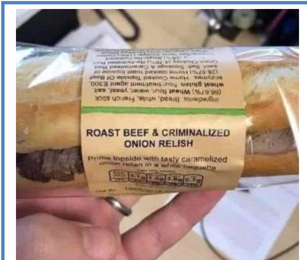
Would this qualify as an unlawful sandwich??

If you eat an entire cake without cutting it, you technically only had one piece