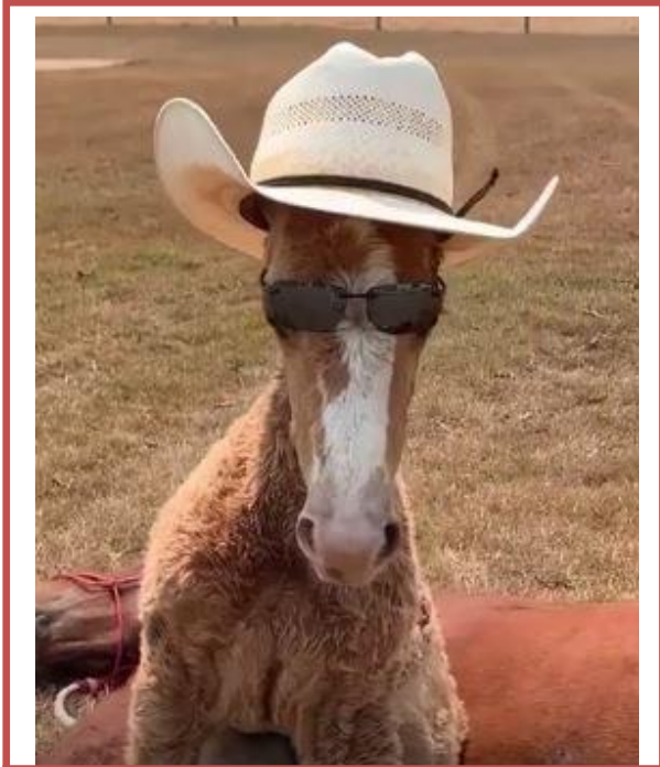
BE COOL, Y'ALL!